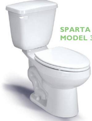
SPARTA ADA HET MODEL 3142-3479 1.28 gpf/4.8 lpf 2" Flushing System ADA Compliant Flushes 800 grams of solids*