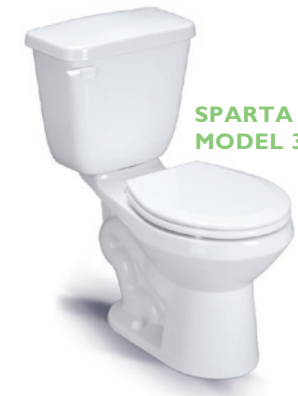
SPARTA RF HET MODEL 3215-3479 1.28 gpf/4.8 lpf 2" Flushing System Flushes 800 grams of solids*