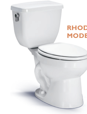
RHODAS ADA DF MODEL 3123-3436 1.6 gpf/6.0 lpf and 1.1 gpf/4.0 lpf Dual-Flush System ADA Compliant Flushes 1,000 grams of solids*