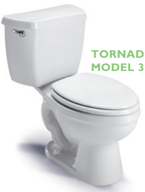
TORNADO EL HET MODEL 3138-3471 1.28 gpf / 4.8 lpf Flushes 700 grams of solids*

AN INDUSTRY-LEADING 1.28 GALLONS PER FLUSH