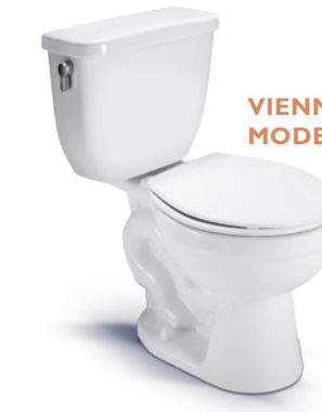
VIENNA RF DF MODEL 3208-3436 1.6 gpf/6.0 lpf and 1.1 gpf/4.0 lpf Dual-Flush System Flushes 600 grams of solids*