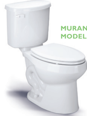
MURANO ADA HET MODEL 3140-3425 1.28 gpf/4.8 lpf 3" Flushing System ADA Compliant Flushes 600 grams of solids**