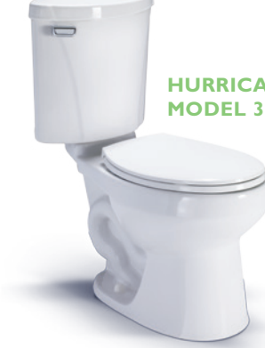
HURRICANE ADA HET MODEL 3140-3473 1.28 gpf/4.8 lpf 3" Flushing System ADA Compliant Flushes 1,000 grams of solids*