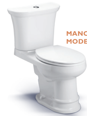
MANCHESTER ADA DF MODEL 3107-3427 1.6 gpf/6.0 lpf and 1.1 gpf/4.0 lpf Dual-Flush System Flushes 600 grams of solids*