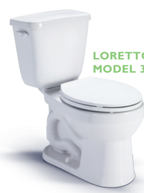
LORETTO RF HET MODEL 3213-3475 1.28 gpf/4.8 lpf 3" Flushing System Flushes 800 grams of solids*