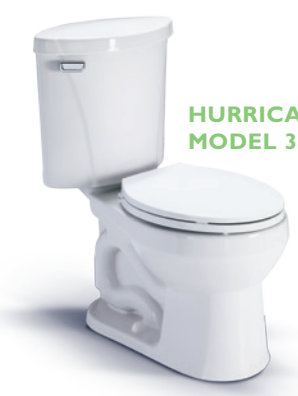
HURRICANE RF HET MODEL 3213-3473 1.28 gpf/4.8 lpf 3" Flushing System Flushes 600 grams of solids*