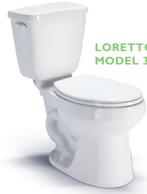
LORETTO ADA HET MODEL 3140-3475 1.28 gpf/4.8 lpf 3" Flushing System ADA Compliant Flushes 1,000 grams of solids*