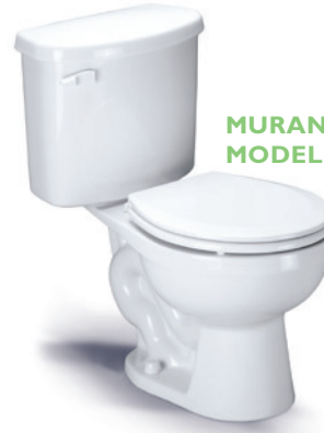
MURANO RF HET MODEL 3219-3425 1.28 gpf/4.8 lpf 3" Flushing System Flushes 500 grams of solids**