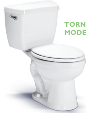
TORNADO ADA HET MODEL 3134-3471 1.28 gpf / 4.8 lpf ADA Compliant Flushes 1,000 grams of solids*

Vortens' 1.28 gpf High-Efficiency Toilets consume 20% less water than traditional 1.6 gpf models.